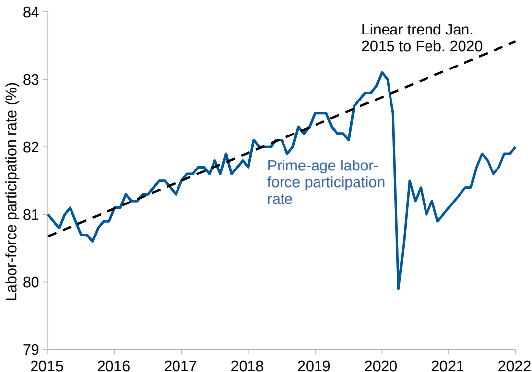
Figure 1: Labor-force participation rate, ages 25–54, January 2015 to January 2022